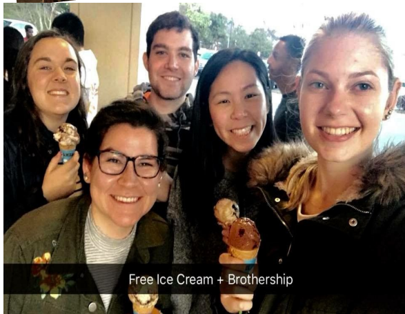
Free Ice Cream + Brotherhood