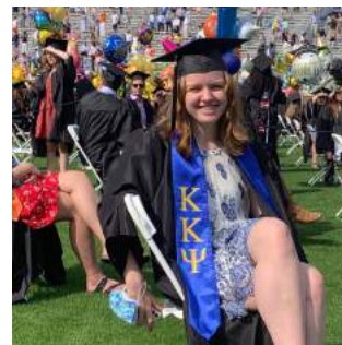
AEA Spirit Award