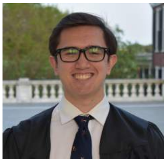
Ben DeForest Service Award