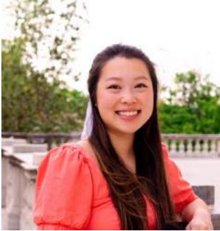
Rachael Beaton Academic Achievement Award