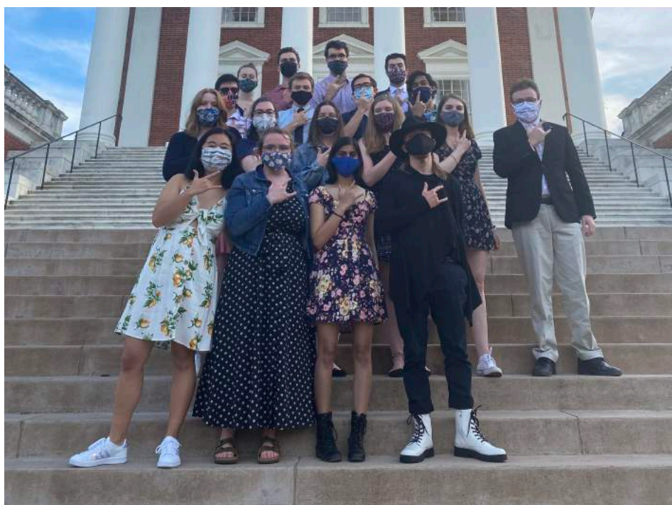
Some brothers before the Alpha Eta class virtual third degree ceremony.

Originally founded on September 23, 1950, and active until 1962, the Beta Chi Chapter of Kappa Kappa Psi was re-founded at the University of Virginia on April 23, 2005. The original chapter supplied the first President and Secretary/Treasurer of the Northeast District in 1958 and hosted the first annual District Convention that same year. Today, Beta Chi provides support for the Cavalier Marching Band and other ensembles in the Charlottesville community. The oldest active chapter in the Southern Precinct, Beta Chi has welcomed over 250 well-qualified musicians into the Brotherhood of Kappa Kappa Psi.