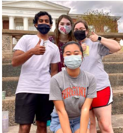
Wholesome content award goes to the AHs