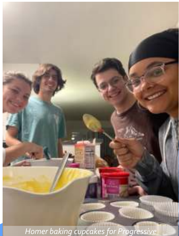
Homer baking cupcakes for Progressive