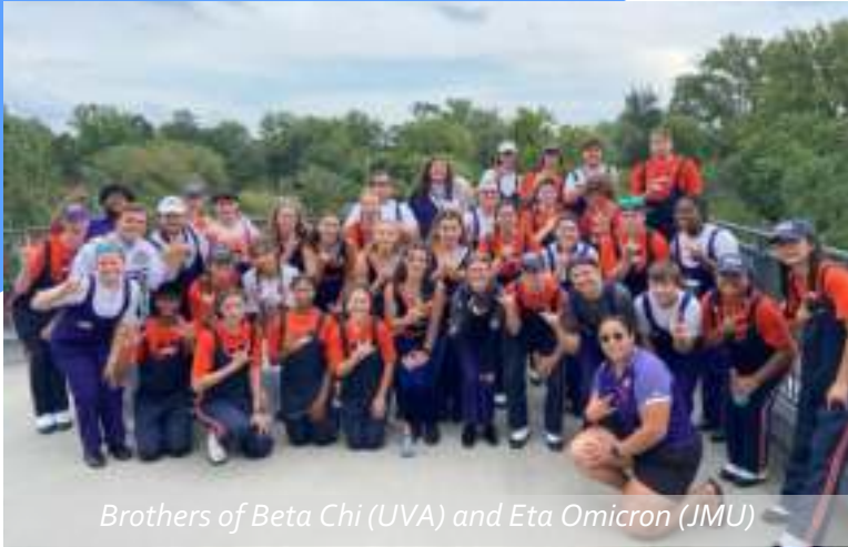
Brothers of Beta Chi (UVA) and Eta Omicron (JMU)