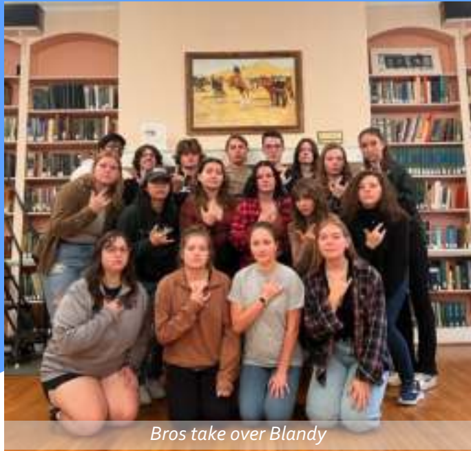
Bros take over Blandy