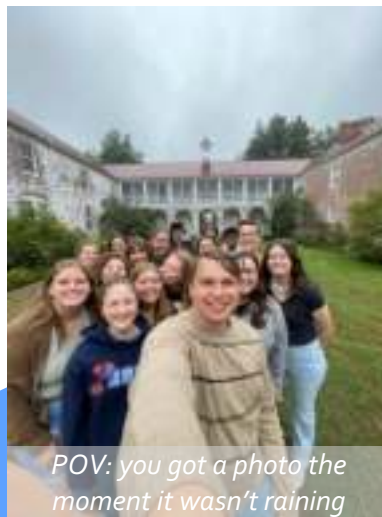
POV: you got a photo the moment it wasn't raining