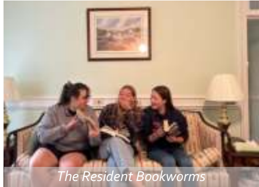
The Resident Bookworms