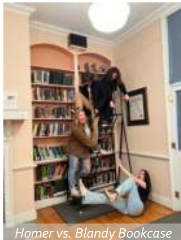
Homer vs. Blandy Bookcase