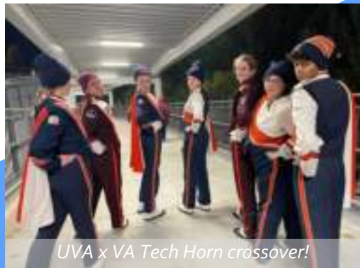
UVA x VA Tech Horn crossover!