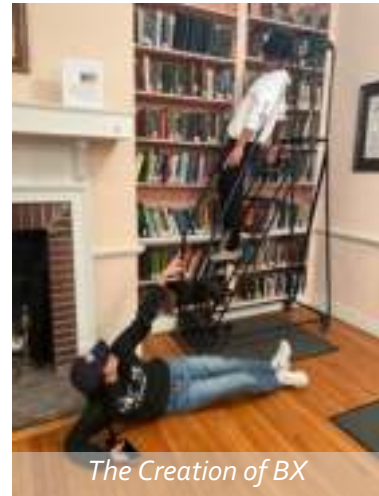
The Creation of BX