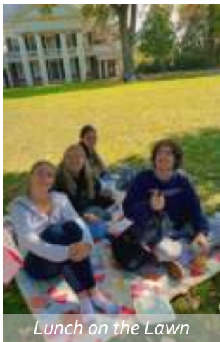
Lunch on the Lawn