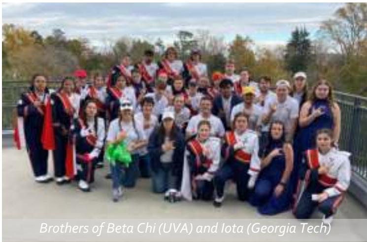
Brothers of Beta Chi (UVA) and Iota (Georgia Tech)